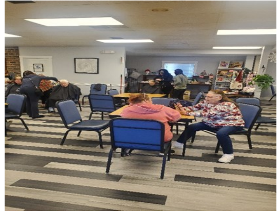
Creative Images hair and nails.